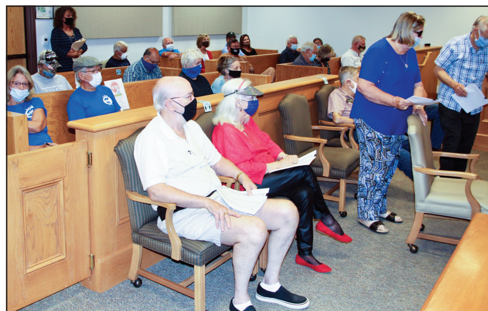
This courtroom at the Union County Courthouse was standing-room only for the commissioner's two public tax increase hearings last week.

The most repeated tax hike complaints were the sudden sharp increase, especially in a pandemic; Paris' judgement in See Tax Increase, Page 2A